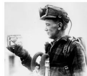
Canary Bird with Coal Miner

So now I am going to show you some of the compelling proof that we are in a reality where we are all going to be working together in a Global Currency Reset to wind down the Banking Cartel. This is what I am going to keep on doing, and you all need to reach out to convince others to join all of us who are already in the "Coalition for the Rule of Law." We have reached critical mass, that is, we are in reality. Stay tuned as we wind down the Banking Cartel and replace fake paper currencies for local currencies issued by villages and towns and for aurum.